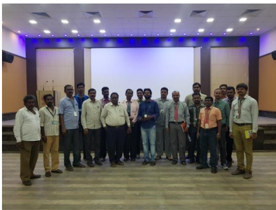
Resource person along with the participants