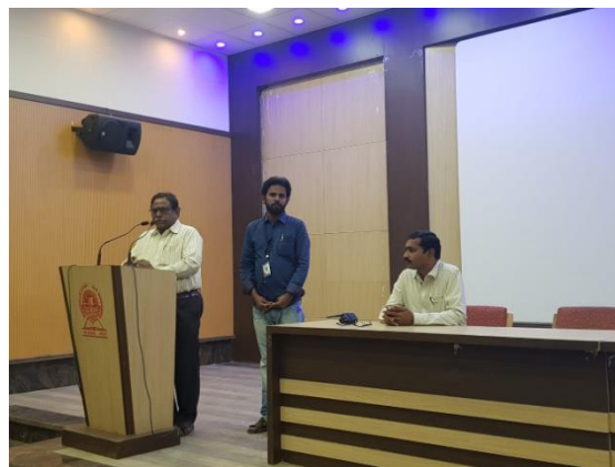
Resource person addressing the audience

An awareness program on a new mobile application was organized at C Block Auditorium in Narayana Engineering College, Nellore on 3 rd February 2018. Health Officer from Nellore served as the resource person and highlighted the importance of reporting about problems in surroundings to officials in municipal office so that action could be taken and the problem could be resolved in short turnaround time. A mobile application called “Puraseva” that has been launched to facilitate problem reporting was demonstrated in the program. Faculty members of CSE department attended the program.