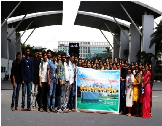
Students of Final Year Section A