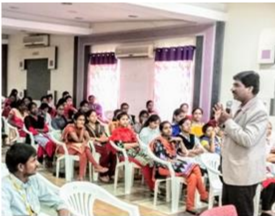
Resource person interacting with the audience