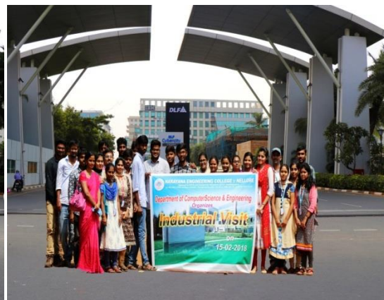
Students of Final Year Section B