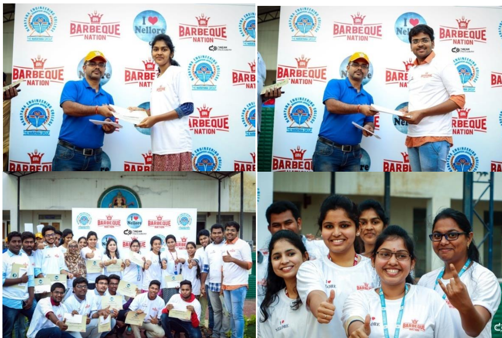
Top: CSE Students being awarded with certificates; Bottom: Prize winners from CSE department celebrating the moment with the other participants

A Biggest Foodie Contest was organized in Narayana Engineering College on 6 th February 2018 at the A Block lawn. The contest was conducted by Barbeque Nation (Chain of Restaurants), Nellore. Students from CSE Department participated in the contest and won the second prize in the contest. Participation certificates were awarded by Barbeque Nation to all participants.