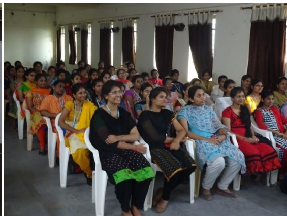
Students participating in the guest lecture