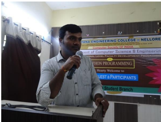
Resource person addressing the audience