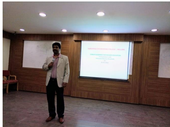
Resource person addressing the audience

A Career Guidance program for Higher Education in association with Princeton Review, New Delhi was organized in Narayana Engineering College, Nellore on 3 rd February 2018. Students of CSE department were given directions on how to realize their aspirations to pursue their higher education. Various alternatives and scope of career path for each course of higher education were vividly explained by the resource person. The students were immensely inspired by the program.